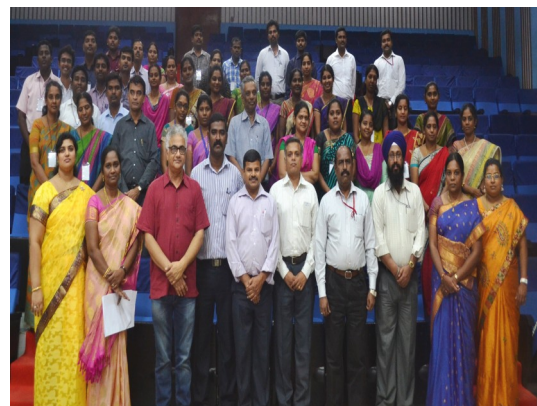
Speakers and Participants of FDP on Creative Pedagogy