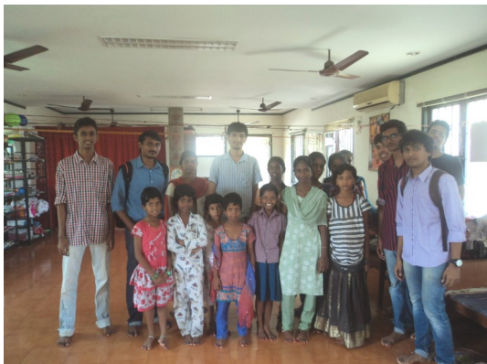
Students at Vishranthi

CSIE organised visits for Innovation and Social Entrepreneurship minor course students to the villages of Annathur, Nathanallur, Kattavakkam, Vandavasi, Vadanemmeli (Irula community) and to Social enterprises Banyan and Vishranthi.